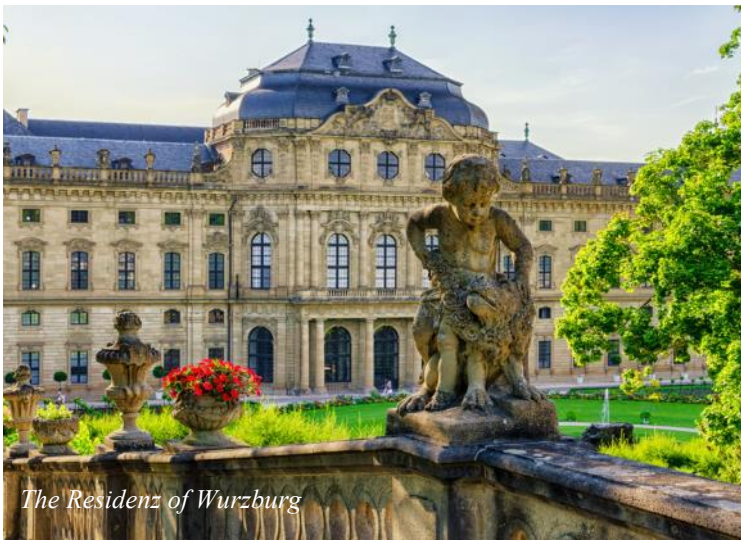
The Residenz of Wurzburg