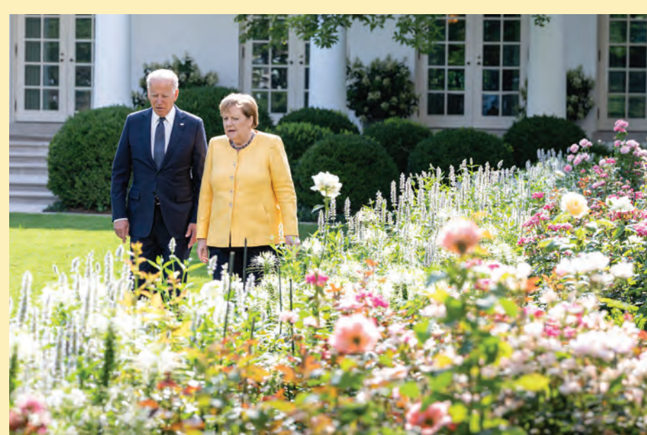
President Biden hosts visiting German Chancellor Merkel at the White House on July 15, 2021.

“The United States of America and Germany...must stand together to deal with the great challenges of our time.”