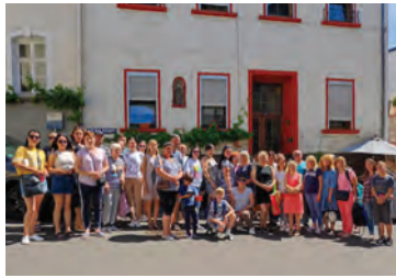
Patrons in front of the GAI supported food shelf