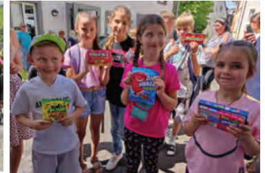
Ukrainian children with their American candy